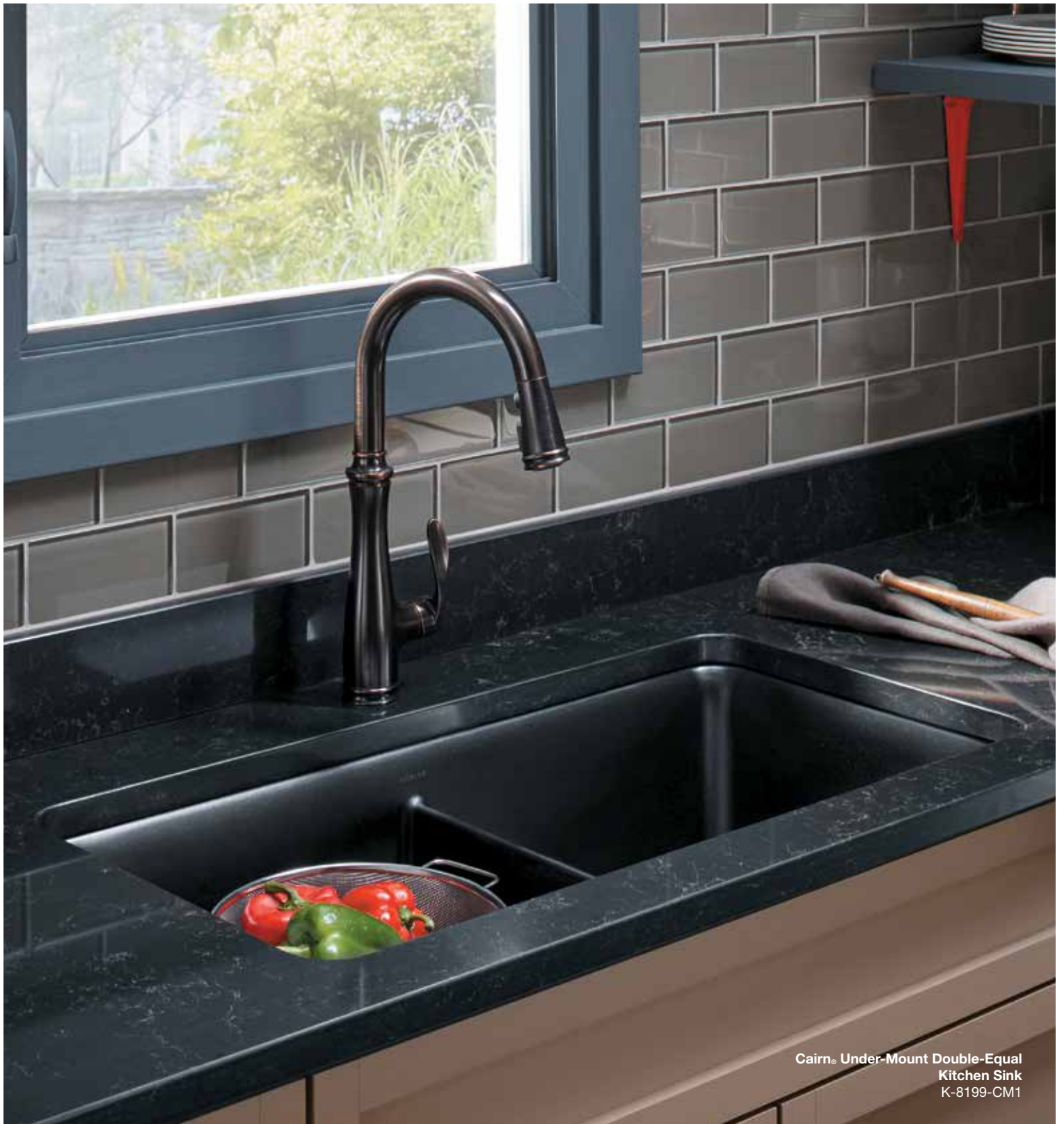
Cairn® Under-Mount Double-Equal Kitchen Sink K-8199-CM1

Cairn Neoroc® Kitchen Sinks Rich Color, Rock-Solid Design