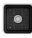
Bar sink (K-8223-CM1)