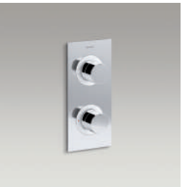
Recessed thermostatic 2-way valve trim 99865-9