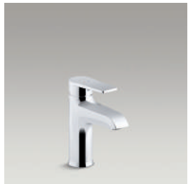
Single-handle bathroom sink faucet without drain 97060-4ND