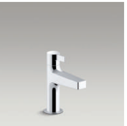
Pillar tap without drain 74028-4ND