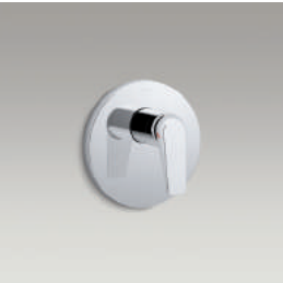
Recessed valve trim for 40 mm valve 97488-4 (shown)

Recessed valve trim with diverter for 40 mm valve 97487-4