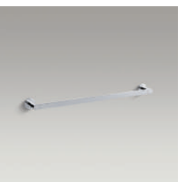
18" towel bar (457 mm) 73141