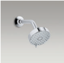
Awaken G110 Multifunction showerhead, showerarm and flange 72419/7397