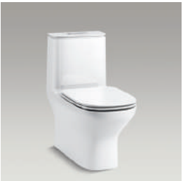
One-piece toilet 77739 Available with 3/6 liter, 3/4.5 liter, or 2.6/4 liter dual flushes