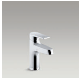
Single-handle bathroom sink faucet 97072D-4 with drain 97074D-4ND without drain