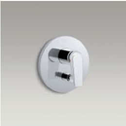
Recessed valve trim with diverter for Modulo™ valve 97366-4 (shown)

Recessed valve trim with diverter for 40 mm valve 97487-4