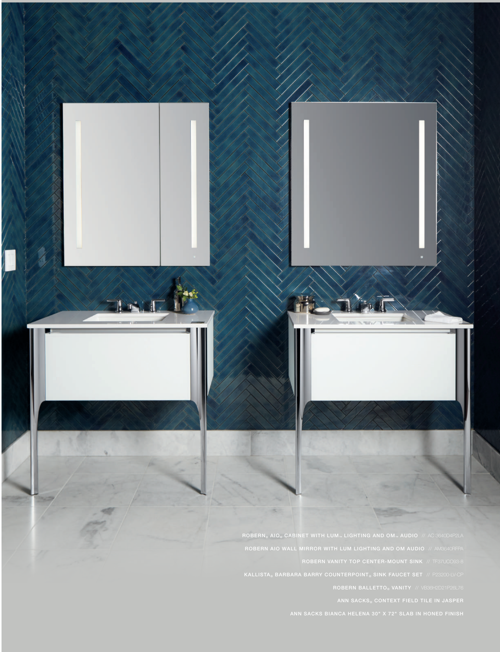
ROBERN® AIO® CABINET WITH LUM™ LIGHTING AND OM™ AUDIO // AQ 3640D4P2LA