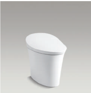
One-piece intelligent toilet 5401 (includes remote)