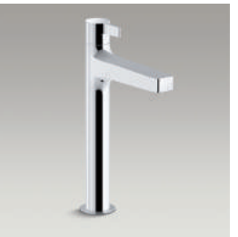
Tall pillar tap without drain 74029-4ND