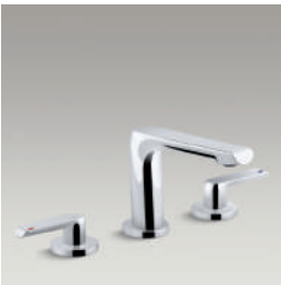
Widespread bathroom sink faucet 97352-4