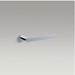
Hand Towel Holder 97498