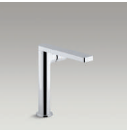
Tower single-handle bathroom sink faucet with pure handle 73054-7* (shown)