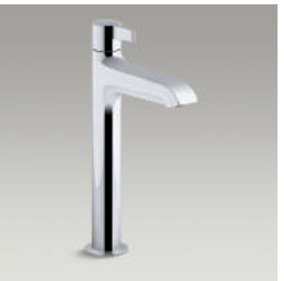
Tall pillar tap without drain 97067-4ND