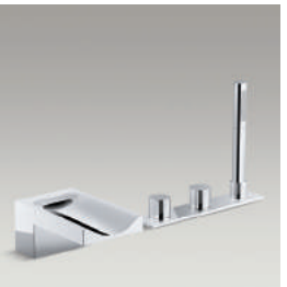
Deck-mount bath faucet 99874-9