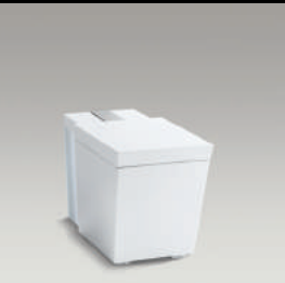
Comfort Height® intelligent toilet 3901

The Numi toilet combines unmatched design, technology and engineering to present the finest in personal comfort and cleansing. From ambient lighting and wireless music capabilities to the heated seat and foot warmers, Numi allows users to personalize settings and fine-tune preferences to create the most advanced toilet experience possible. With a striking form, brilliant features and unrivaled water efficiency, the Numi toilet marks a new standard of excellence in the bathroom.