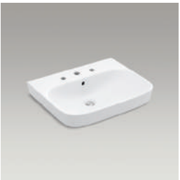
Vessel bathroom sink, 35" (600 mm) VM112K*