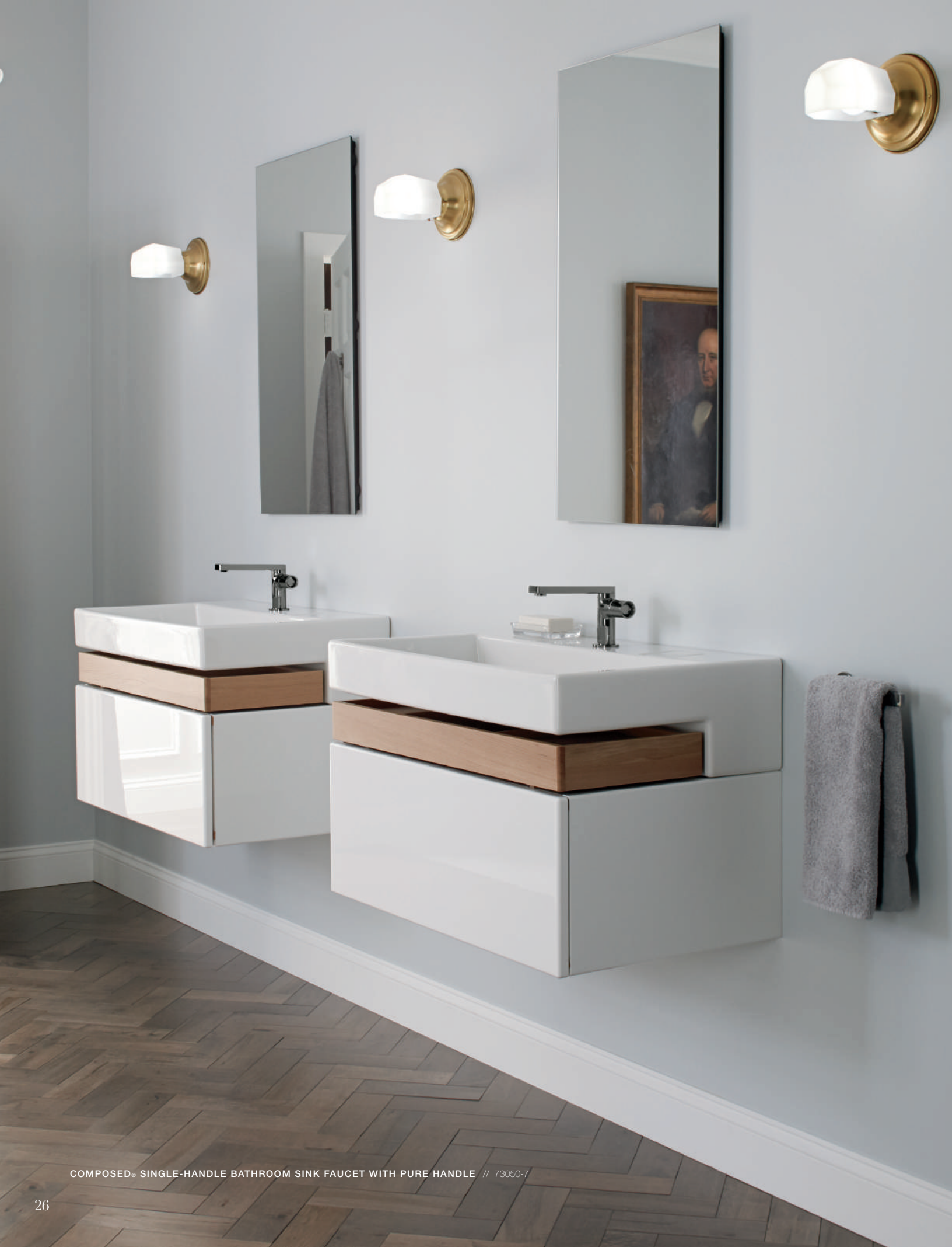
COMPOSED® SINGLE-HANDLE BATHROOM SINK FAUCET WITH PURE HANDLE // 73050-7