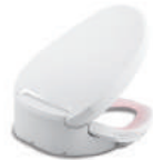
C3®-150 CLEANSING TOILET SEAT 2015/2016 IF DESIGN AWARD 2015 IDEA FEATURED FINALIST