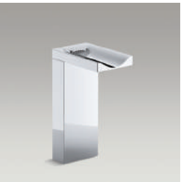
Tall single-handle bathroom sink faucet 99858-4