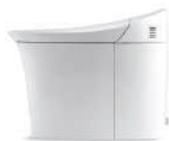
VEIL® INTELLIGENT TOILET 2015 IDEA SILVER AWARD 2015 DESIGN FOR ASIA SILVER AWARD