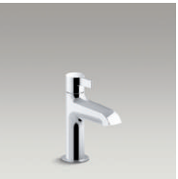
Pillar tap without drain 97066-4ND