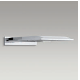
Wall-mount showerhead 72830