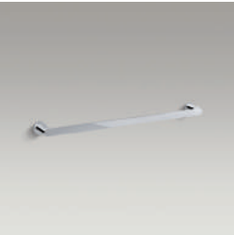
18" towel bar (457 mm) 97494

Recessed valve trim for Modulo valve 97365-4