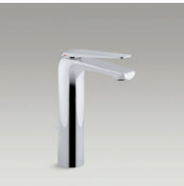
Tall single-handle bathroom sink faucet 97347-4