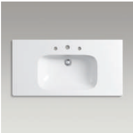
Vanity-top bathroom sink, 35" (900 mm) XAK112K*