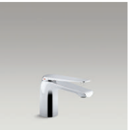
Single-handle bathroom sink faucet 97345-4