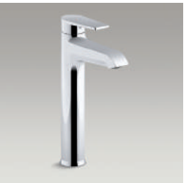
Tall single-handle bathroom sink faucet without drain 97062-4ND