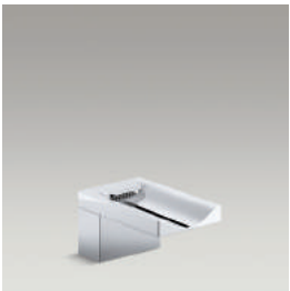
Single-handle bathroom sink faucet 99856-4