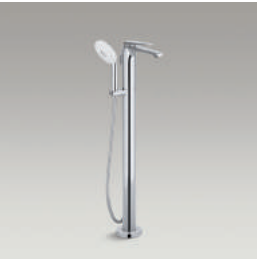
Floor-mount bath filler with handshower, includes all components 97367-4