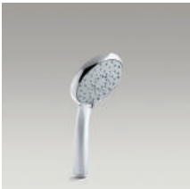
Awaken B110 Multifunction handshower 72421