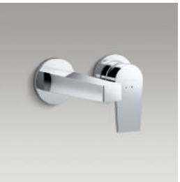
Single-handle wall-mount bathroom sink faucet 74027-4