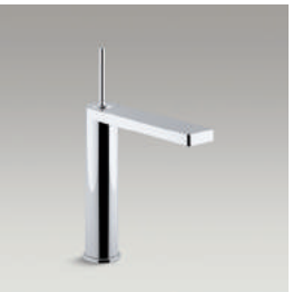
Tall single-handle bathroom sink faucet with joystick handle 73053-4* (shown)