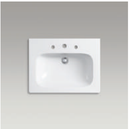
Vanity-top bathroom sink, 24" (600 mm) XAL112K*

A masterpiece of modern essentialism, ModernLife combines controlled proportion with inherent practicality in effortless fashion. Designed with elegant simplicity, this suite of fixtures features both clean lines and easy-to-clean surfaces to make it as stunning as it is sensible. From the toilet to the vessel to the vanity top, ModernLife introduces a purity of detail that is timeless, fresh, clean and harmonious.