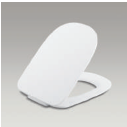
Slim toilet seat 77168 (Quick-Release™) 20139 (Purefresh® and Nightlight with Quick Release™)