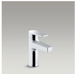
Single-handle bathroom sink faucet without drain 74013-4ND