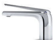
AVID™ SINGLE-HANDLE FAUCET 2015 RED DOT AWARD WINNER