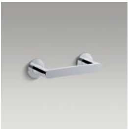
Pivoting toilet tissue holder 73147 (shown)