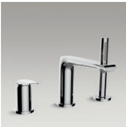
Deck-mount bath faucet with handshower 97360-4