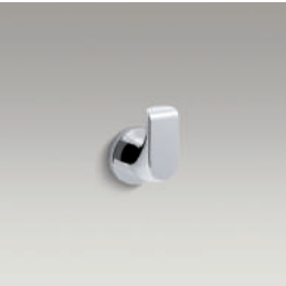
Robe hook 97499 (shown)