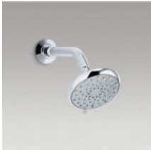
Awaken B110 Multifunction showerhead, showerarm and flange 72425/7397