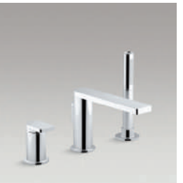
Single-handle bath faucet with handshower 73078-4