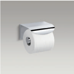
Covered toilet tissue holder 97503 (shown)