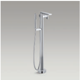
Floor-mount bath faucet with handshower 73087-4