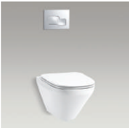
Wall-hung toilet (flush plate not included) 77725 compatible with cisterns from 2.6/4 liters upwards