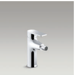
Single-handle bidet faucet 74030D-4