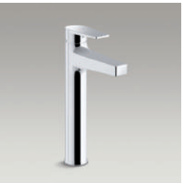
Tall single-handle bathroom sink faucet without drain 74026-4ND