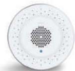
MOXIE® SHOWERHEAD 2014 IF PRODUCT DESIGN AWARD 2014 GOOD DESIGN AWARD 2013 IDEA/IDSA SILVER AWARD