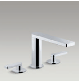
Widespread bathroom sink faucet with lever handles 73060-4* (shown)