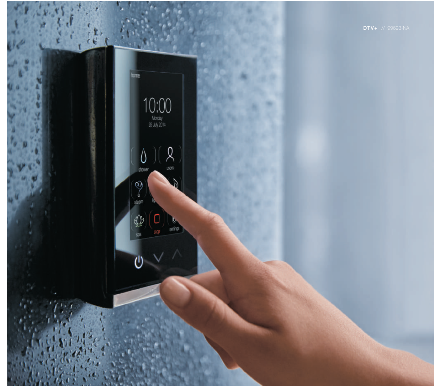
DTV+ // 99693-NA