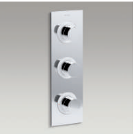
Recessed thermostatic 4-way valve trim 99867-9