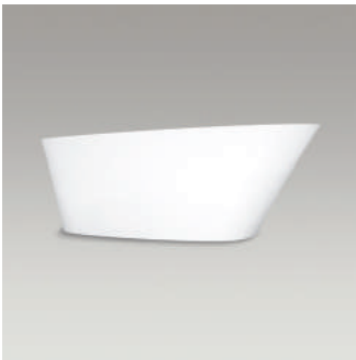
Freestanding bath 8331