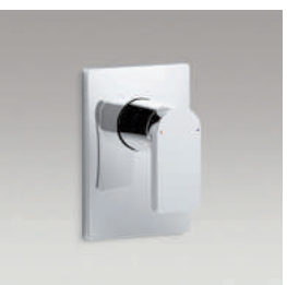
Recessed valve trim for 40 mm valve 73098-4 (shown)