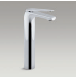
Tower single-handle bathroom sink faucet 97348-4