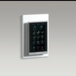
Premium remote 7420