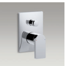
Recessed valve trim with diverter for Modulo™ valve 73108-4 (shown)