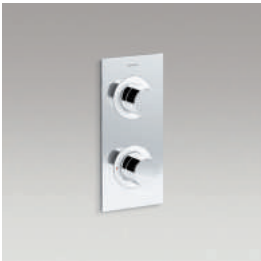
Recessed thermostatic 3-way valve trim 99866-9