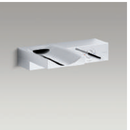
Wall-mount bathroom sink faucet 99876-4