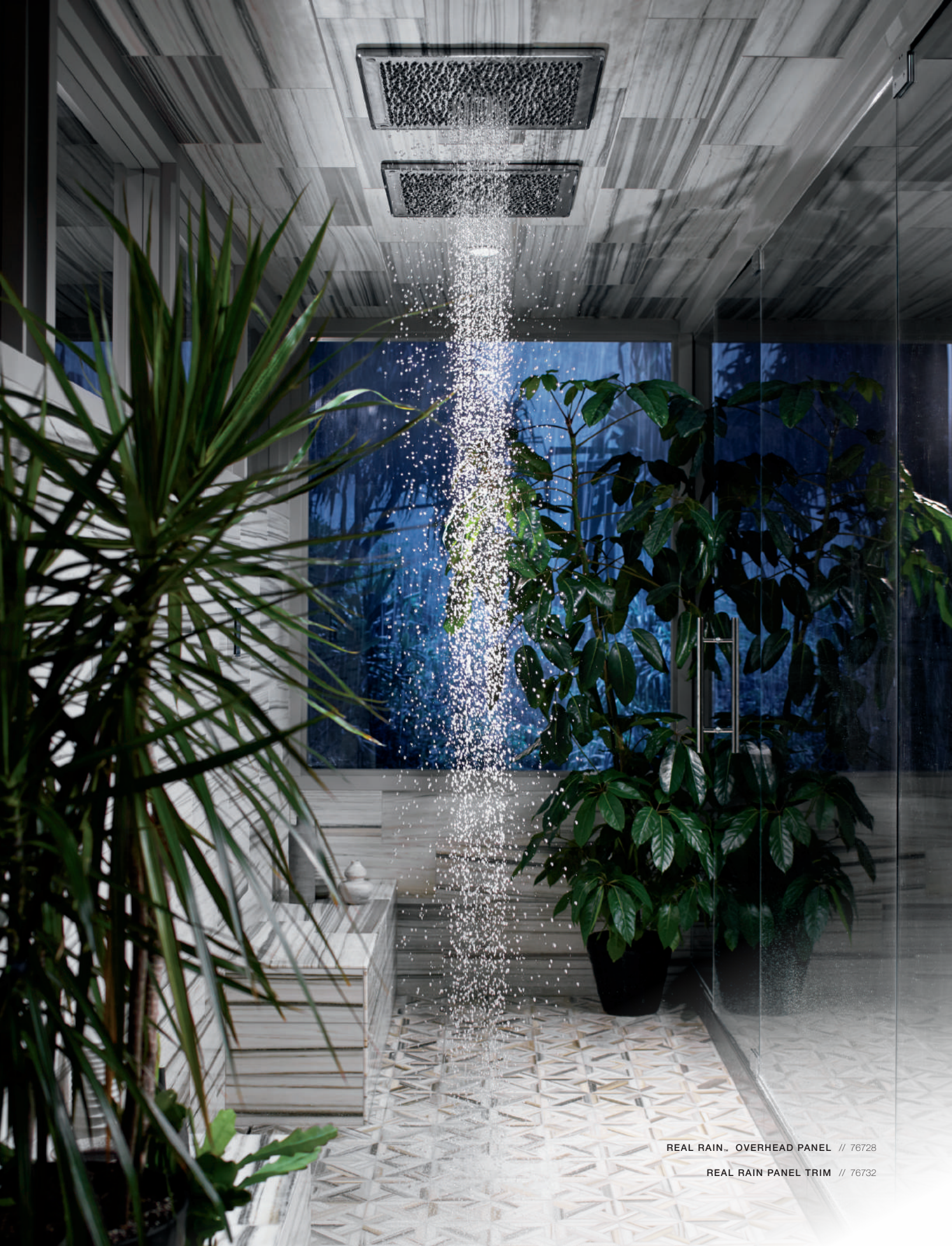
REAL RAIN™ OVERHEAD PANEL // 76728