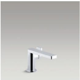
Single-handle bathroom sink faucet with lever handle 73167-4 (shown)