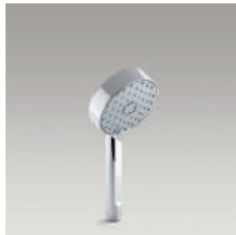
Awaken G110 Multifunction handshower 72415

Awaken showerheads and handshowers are powered by an advanced spray engine, delivering the signature experience that sets KOHLER showering apart-at a great price. As beautiful as they are powerful, Awaken showerheads come in two distinct design options, each inspired by patterns, symmetries and rhythms found in nature.