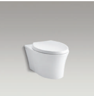
Wall-hung toilet 6299 (533mm) 5722 (554mm)

In tune with the most modern rituals of life, the Veil collection delivers delightful moments through inspired, elegant design and integrated connectivity. From the intelligent and wall-hung toilets to the freestanding bath, Kohler brilliantly shapes forward-thinking functionality, uncommon individual comfort and streamlined, understated style to evolve and enhance the modern bathroom experience.