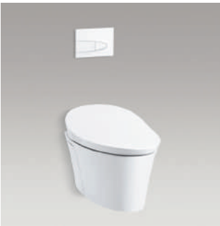
Wall-hung intelligent toilet 5402 (Includes remote and flush plate)